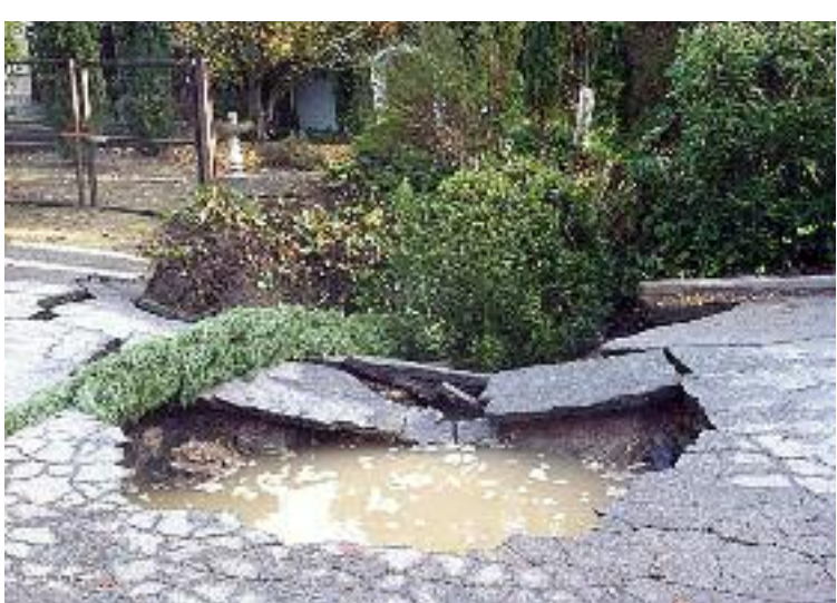
In December 2012, a pipe failure led to the formation of a sinkhole on Tarabrook Drive at Evergreen. Adopting humor in the face of adversity, some Orindans christened the area "Tarabrook Lake" during the worst moments of the emergency.

Drain failures are ugly, they're expensive, and they can upend the lives of those they impact for years as cities struggle to move from emergency response to cleanup and complete system overhaul. Just ask Orindans who live in the city's Glori-